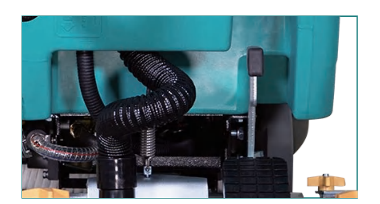
30kg & 50kg brush pressures adjustable