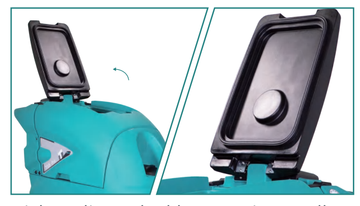
High quality seal rubber ensuring excellent leak-proof.