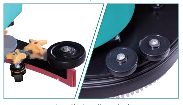
Anti-collision/brush disc adopts anti-collision design