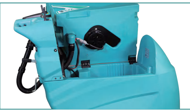
Side flip water tank + Buckles on both sides