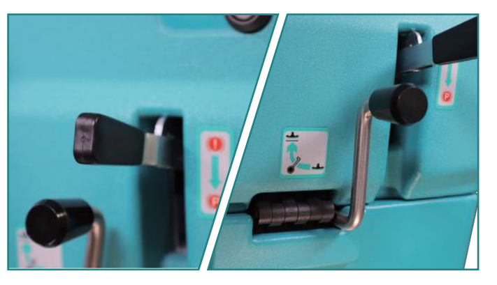
Ergonomically designed control handles